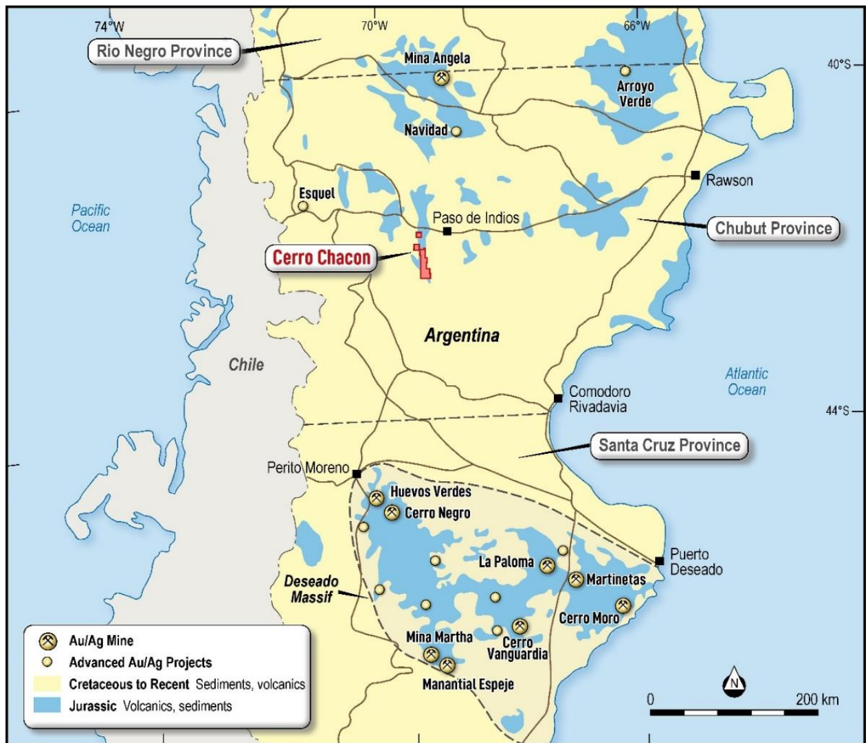
Figure 2: Location of Piche's Cerro Chacon Project

Previously the Chacon Grid had been mapped and sampled over a strike length of two kilometres, but recent reconnaissance has indicated the structure may extend for a strike length of up to six kilometres. It is expected that further mapping, geochemistry, geophysics and drilling along strike and between both the Chacon Grid and the La Javiela vein systems will highlight a mineralised structural corridor up to 10km in length.